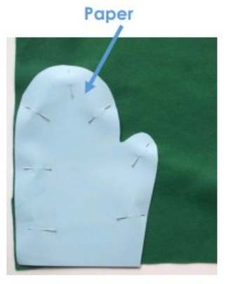
Use pins to secure the pattern on the fabric. Cut around the pattern.