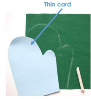
Use soft chalk pastel or soft white crayon to draw around the pattern prior to cutting out.