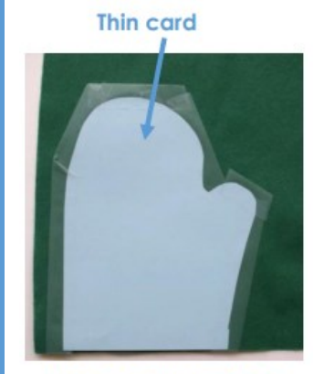
Use clear sticky tape to position pattern on fabric. Cut around the pattern.