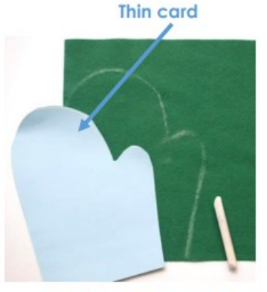
Use soft chalk pastel or soft white crayon to draw around the pattern prior to cutting out.