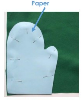
Use pins to secure the pattern on the fabric. Cut around the pattern.