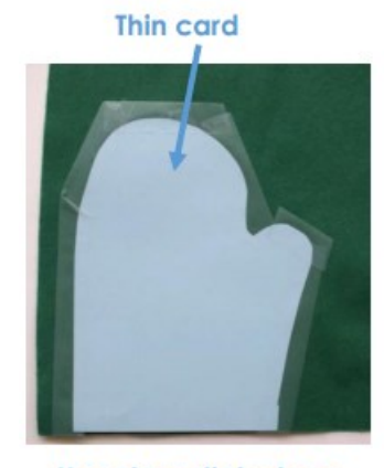
Use clear sticky tape to position pattern on fabric. Cut around the pattern.